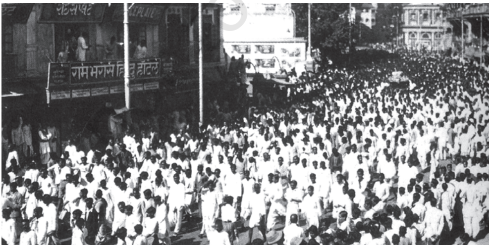
Fig. 1 – 6 April 1919. Mass processions on the streets became a common feature during the national movement.

In an earlier textbook you have read about the growth of nationalism in India up to the first decade of the twentieth century. In this chapter we will pick up the story from the 1920s and study the Non-Cooperation and Civil Disobedience Movements. We will explore how the Congress sought to develop the national movement, how different social groups participated in the movement, and how nationalism captured the imagination of people.