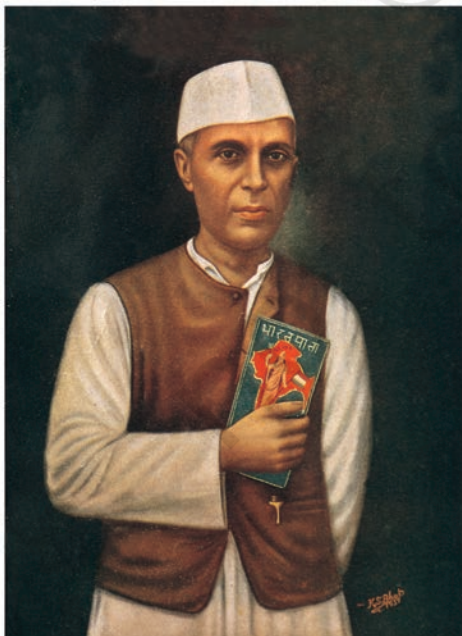
Fig. 13 – Jawaharlal Nehru, a popular print.

Notice that the mother figure here is shown as dispensing learning, food and clothing. The mala in one hand emphasises her ascetic quality. Abanindranath Tagore, like Ravi Varma before him, tried to develop a style of painting that could be seen as truly Indian.