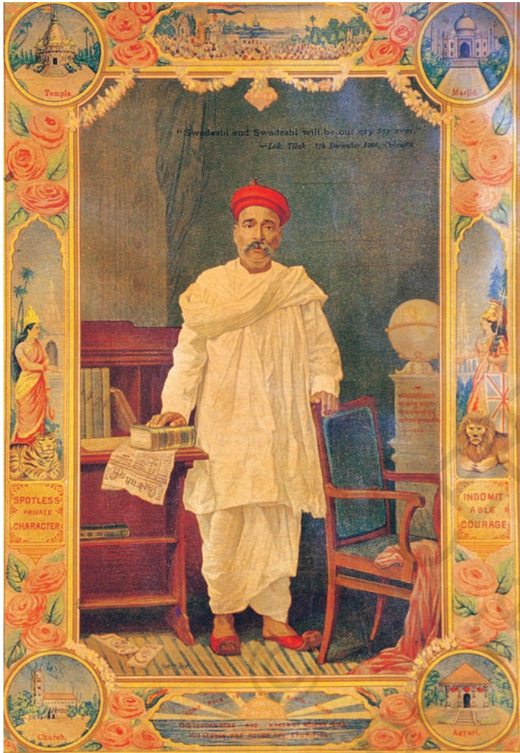
Fig. 11 – Bal Gangadhar Tilak, an early-twentieth-century print. Notice how Tilak is surrounded by symbols of unity. The sacred institutions of different faiths (temple, church, masjid) frame the central figure.

Nationalism spreads when people begin to believe that they are all part of the same nation, when they discover some unity that binds them together. But how did the nation become a reality in the minds of people? How did people belonging to different communities, regions or language groups develop a sense of collective belonging?