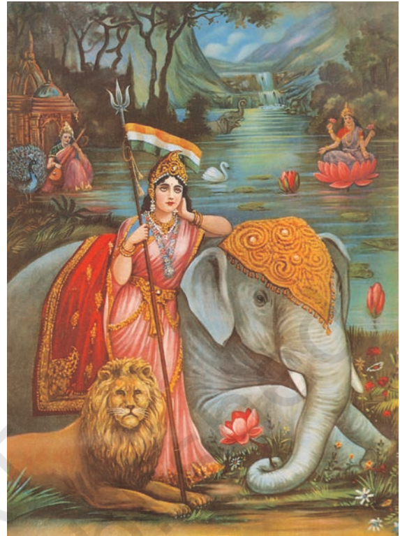
Fig. 14a – Bharat Mata.

This figure of Bharat Mata is a contrast to the one painted by Abanindranath Tagore. Here she is shown with a trishul, standing beside a lion and an elephant – both symbols of power and authority.