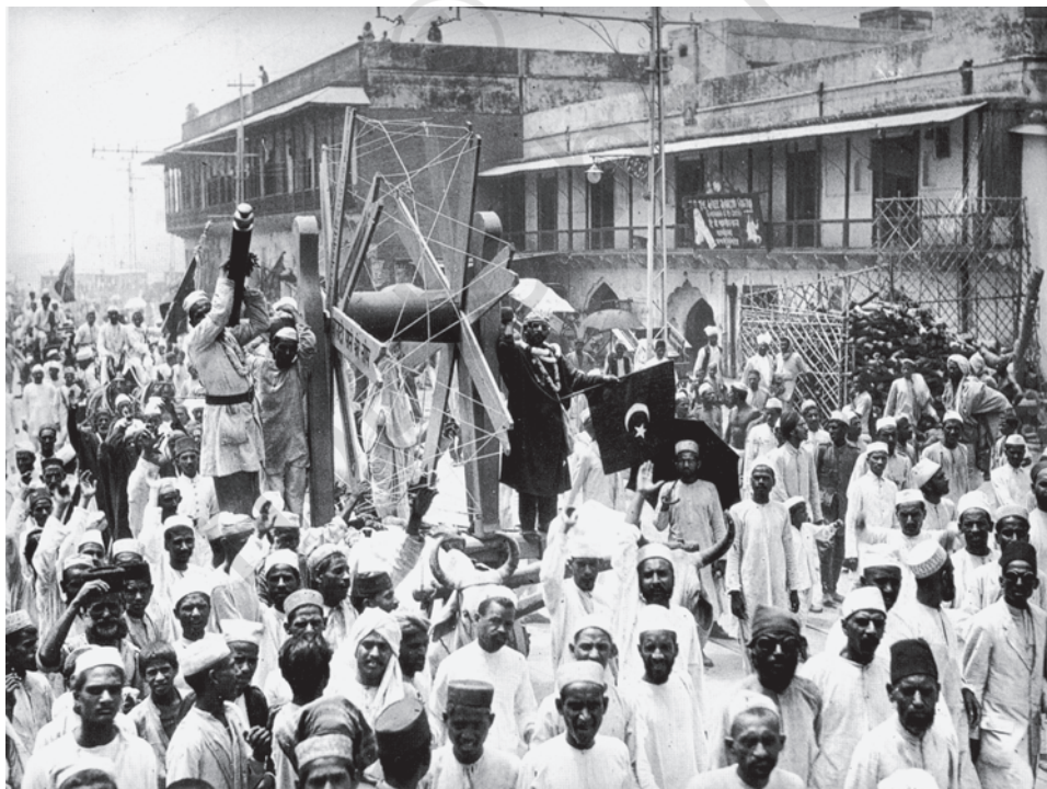
Fig. 4 – The boycott of foreign cloth, July 1922. Foreign cloth was seen as the symbol of Western economic and cultural domination.

Boycott – The refusal to deal and associate with people, or participate in activities, or buy and use things; usually a form of protest