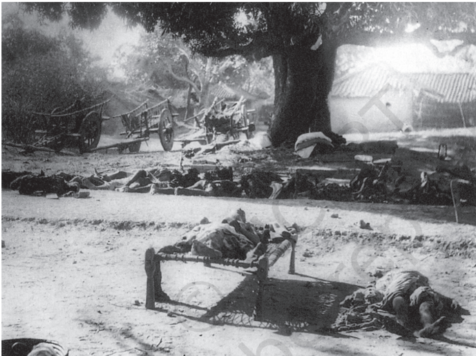
Fig. 5 – Chauri Chaura, 1922.

The visions of these movements were not defined by the Congress programme. They interpreted the term swaraj in their own ways, imagining it to be a time when all suffering and all troubles would be over. Yet, when the tribals chanted Gandhiji's name and raised slogans demanding ' Swatantra Bharat ', they were also emotionally relating to an all-India agitation. When they acted in the name of Mahatma Gandhi, or linked their movement to that of the Congress, they were identifying with a movement which went beyond the limits of their immediate locality.