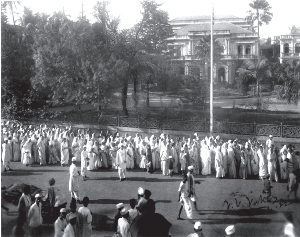
Fig. 9 – Women join nationalist processions. During the national movement, many women, for the first time in their lives, moved out of their homes on to a public arena. Amongst the marchers you can see many old women, and mothers with children in their arms.

picketed foreign cloth and liquor shops. Many went to jail. In urban areas these women were from high-caste families; in rural areas they came from rich peasant households. Moved by Gandhiji's call, they began to see service to the nation as a sacred duty of women. Yet, this increased public role did not necessarily mean any radical change in the way the position of women was visualised. Gandhiji was convinced that it was the duty of women to look after home and hearth, be good mothers and good wives. And for a long time the Congress was reluctant to allow women to hold any position of authority within the organisation. It was keen only on their symbolic presence.