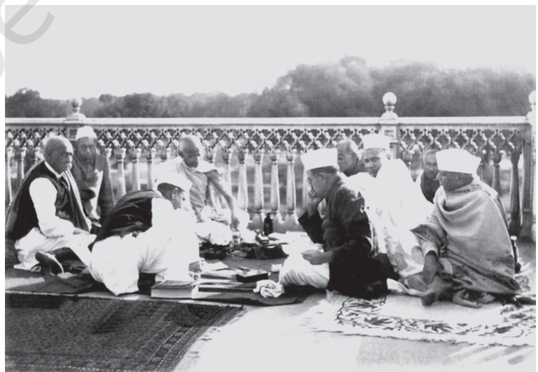
Fig. 6 – Meeting of Congress leaders at Allahabad, 1931. Apart from Mahatma Gandhi, you can see Sardar Vallabhbhai Patel (extreme left), Jawaharlal Nehru (extreme right) and Subhas Chandra Bose (fifth from right).

Lala Lajpat Rai was assaulted by the British police during a peaceful demonstration against the Simon Commission. He succumbed to injuries that were inflicted on him during the demonstration.