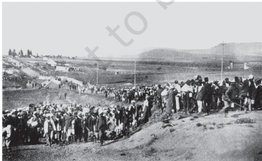
Fig. 2 – Indian workers in South Africa march through Volksrust, 6 November 1913.

Mahatma Gandhi returned to India in January 1915. As you know, he had come from South Africa where he had successfully fought