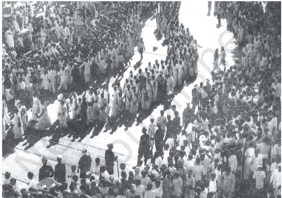
Fig. 14b Women's procession in Bombay during the Quit India Movement

A growing anger against the colonial government was thus bringing together various groups and classes of Indians into a common struggle for freedom in the first half of the twentieth century. The Congress under the leadership of Mahatma Gandhi tried to channel people's grievances into organised movements for independence. Through such movements the nationalists tried to forge a national unity. But as we have seen, diverse groups and classes participated in these movements with varied aspirations and expectations. As their grievances were wide-ranging, freedom from colonial rule also meant different things to different people. The Congress continuously attempted to resolve differences, and ensure that the demands of one group did not alienate another. This is precisely why the unity within the movement often broke down. The high points of Congress activity and nationalist unity were followed by phases of disunity and inner conflict between groups.