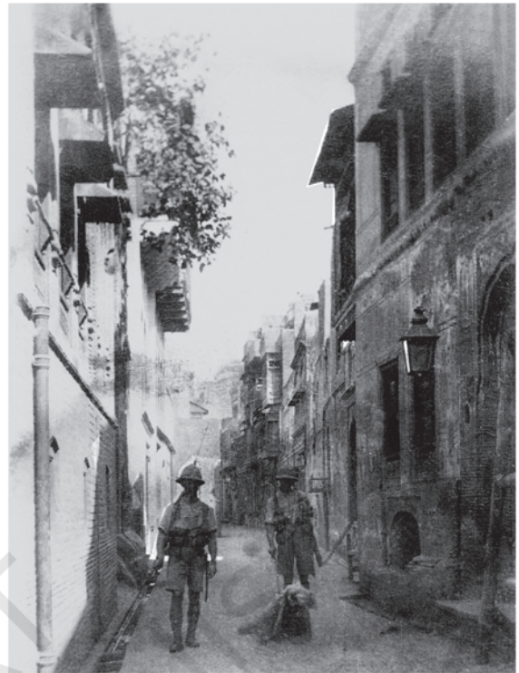
Fig. 3 – General Dyer's 'crawling orders' being administered by British soldiers, Amritsar, Punjab, 1919.

In his famous book Hind Swaraj (1909) Mahatma Gandhi declared that British rule was established in India with the cooperation of