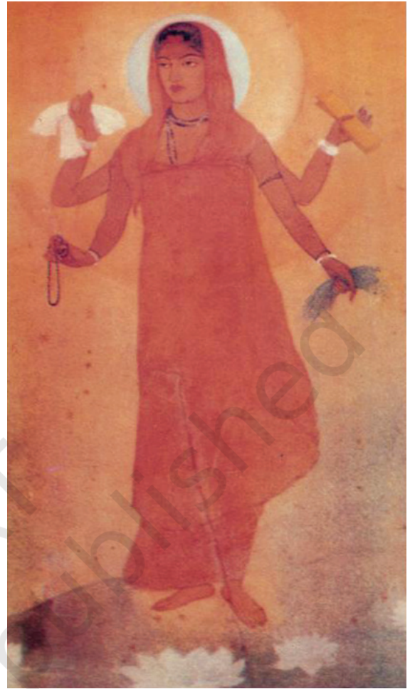
Fig. 12 – Bharat Mata, Abanindranath Tagore, 1905.

Ideas of nationalism also developed through a movement to revive Indian folklore. In late-nineteenth-century India, nationalists began recording folk tales sung by bards and they toured villages to gather folk songs and legends. These tales, they believed, gave a true picture of traditional culture that had been corrupted and damaged by outside forces. It was essential to preserve this folk tradition in order to discover one’s national identity and restore a sense of pride in one’s past. In Bengal, Rabindranath Tagore himself began collecting ballads, nursery rhymes and myths, and led the movement for folk