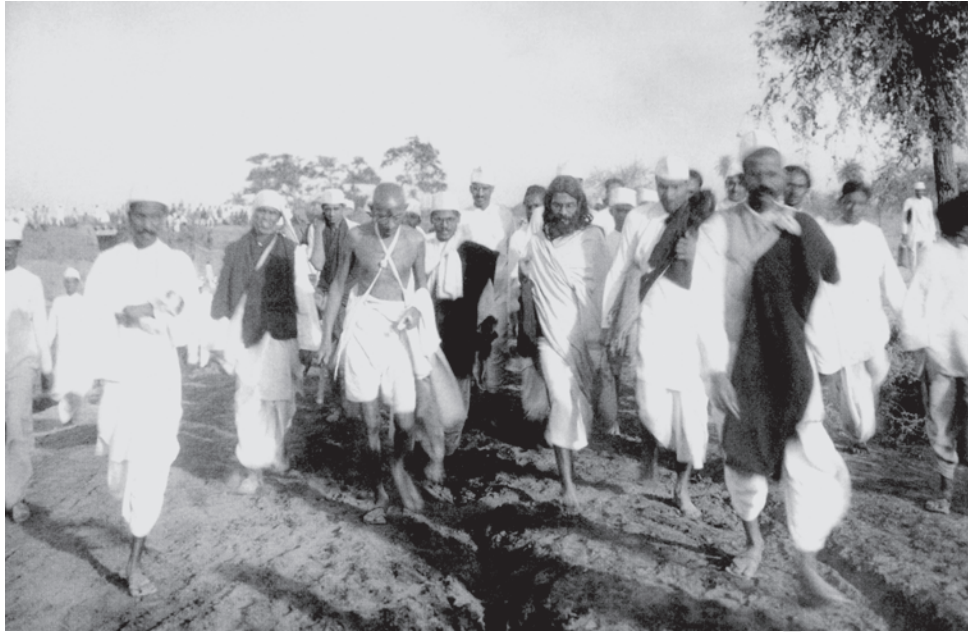
Fig. 7 – The Dandi march. During the salt march Mahatma Gandhi was accompanied by 78 volunteers. On the way they were joined by thousands.

with the British, as they had done in 1921-22, but also to break colonial laws. Thousands in different parts of the country broke the salt law, manufactured salt and demonstrated in front of government salt factories. As the movement spread, foreign cloth was boycotted, and liquor shops were picketed. Peasants refused to pay revenue and chankidari taxes, village officials resigned, and in many places forest people violated forest laws – going into Reserved Forests to collect wood and graze cattle.