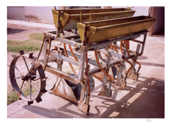
Fig. 4.15: Modern technological equipments used in agriculture

reforms. Provision for crop insurance against drought, flood, cyclone, fire and disease, establishment of Grameen banks, cooperative societies and banks for providing loan facilities to the farmers at lower rates of interest were some important steps in this direction.