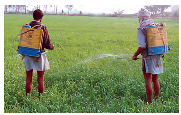
Fig. 4.17 Problems associated with heavy pesticide use are widely recognised in developed and developing countries

A few economists think that Indian farmers have a bleak future if they continue growing foodgrains on the holdings that grow smaller