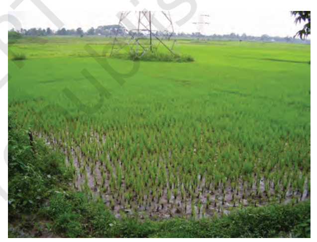
Fig. 4.4 (a): Rice Cultivation

Rice: It is the staple food crop of a majority of the people in India. Our country is the second largest producer of rice in the world after China. It is a kharif crop which requires high temperature, (above 25°C) and high humidity with annual rainfall above 100 cm. In the areas of less rainfall, it grows with the help of irrigation.