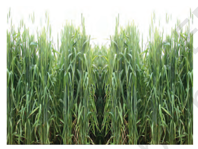
Fig. 4.5: Wheat Cultivation

wheat: This is the second most important cereal crop. It is the main food crop, in north and north-western part of the country. This rabi crop requires a cool growing season and a bright sunshine at the time of ripening. It requires 50 to 75 cm of annual rainfall evenly-distributed over the growing season. There are two important wheat-growing zones in the country – the Ganga-Satluj plains in the north-west and black soil region of the Deccan. The major wheat-producing states are Punjab, Haryana, Uttar Pradesh, Madhya Pradesh, Bihar and Rajasthan.