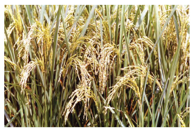
Fig. 4.4 (b): Rice is ready to be harvested in the field