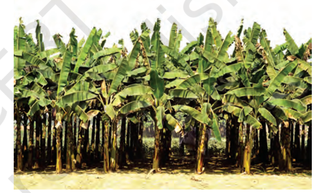
Fig. 4.2: Banana plantation in Southern part of India

In India, tea, coffee, rubber, sugarcane, banana, etc., are important plantation crops. Tea in Assam and North Bengal coffee in Karnataka are some of the important plantation crops grown in these states. Since the production is mainly for market, a well-developed network of transport and communication connecting the plantation areas, processing industries and markets plays an important role in the development of plantations.