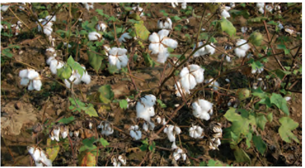
Fig. 4.14: Cotton Cultivation

Cotton: India is believed to be the original home of the cotton plant. Cotton is one of the main raw materials for cotton textile industry. In 2017, India was second largest producer of cotton after China. Cotton grows well in drier parts of the black cotton soil of the Deccan plateau. It requires high temperature, light rainfall or irrigation, 210 frost-free days and bright sun-shine for its growth. It is a kharif crop and requires 6 to 8 months to mature. Major cotton-producing states are–Maharashtra, Gujarat, Madhya Pradesh,