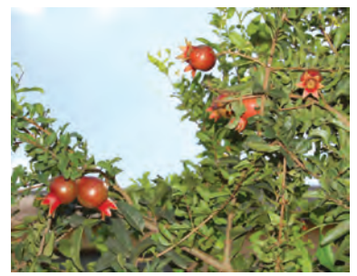
Fig. 4.12: Apricots, apple and pomegranate