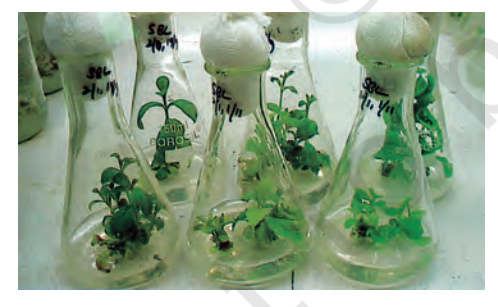
Fig. 4.16: Tissue culture of teak clones

countries because of the highly subsidised agriculture in those countries.