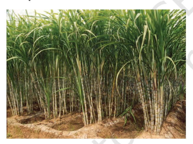
Fig. 4.8: Sugarcane Cultivation

Sugarcane: It is a tropical as well as a subtropical crop. It grows well in hot and humid climate with a temperature of 21°C to 27°C and an annual rainfall between 75cm. and 100cm. Irrigation is required in the regions of low rainfall. It can be grown on a variety of soils and needs manual labour from