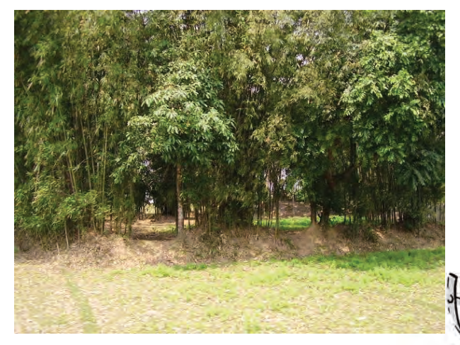
Fig. 4.3: Bamboo plantation in North-east