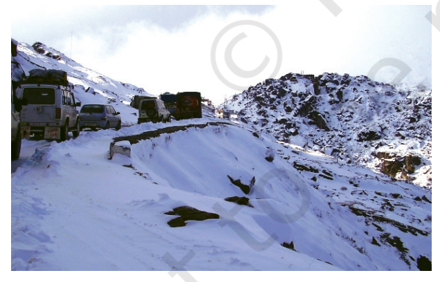
Fig. 7.4: Traffic on north-eastern border road (Arunachal Pradesh)

Roads can also be classified on the basis of the type of material used for their construction such as metalled and unmetalled roads. Metalled roads may be made of cement, concrete or even bitumen of coal, therefore,