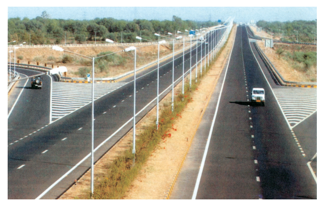
Fig. 7.2: Ahmedabad- Vadodara Expressway