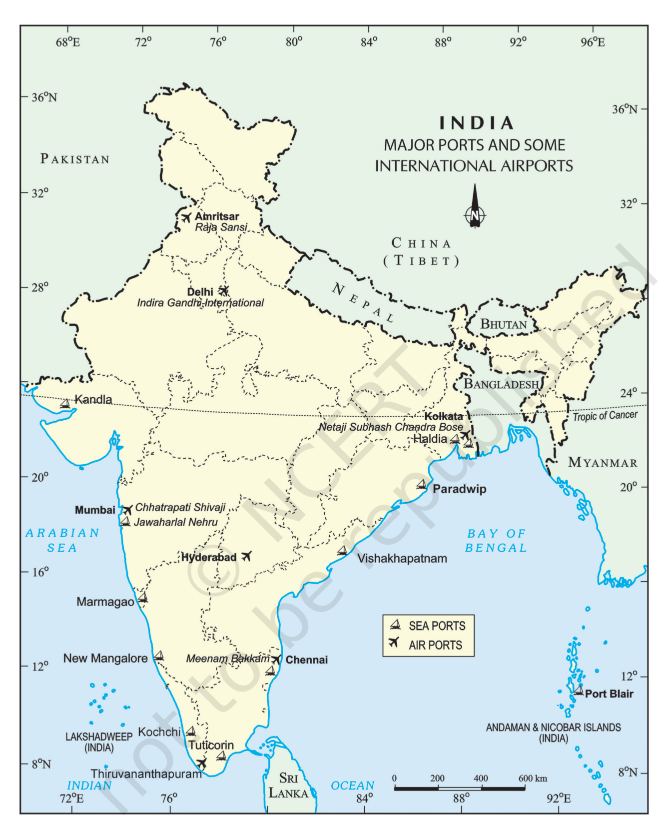
India: Major Ports and Some International Airports