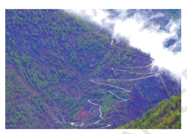
Fig. 7.3: Hilly Tracts