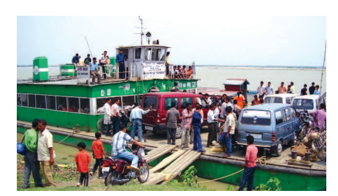
Fig. 7.5: Inland waterways widely used in north-eastern states