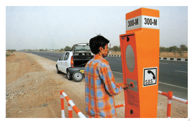
Fig.7.10: Emergency call box on NH-8

Digital India is an umbrella programme to prepare India for a knowledge based transformation. The focus of Digital India Programme is on being transformative to realise – IT (Indian Talent) + IT (Information Technology)=IT (India Tomorrow) and is on making technology central to enabling change.