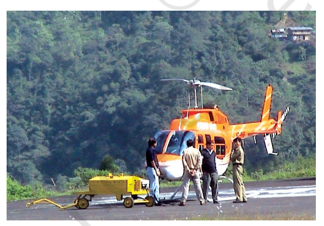
Why is air travel preferred in the north- ∡ eastern states?

The air travel, today, is the fastest, most comfortable and prestigious mode of transport. It can cover very difficult terrains