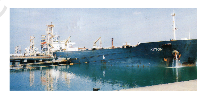
Fig. 7.7: Tanker discharging crude oil at New Mangalore port

Mumbai is the biggest port with a spacious natural and well-sheltered harbour. The Jawaharlal Nehru port was planned with a view to decongest the Mumbai port and serve as a hub port for this region. Marmagao port (Goa) is the premier iron ore exporting port of the country. This port accounts for about fifty per cent of India's iron ore export. New Mangalore port, located in Karnataka caters to the export of iron ore concentrates from Kudremukh mines. Kochchi is the extreme south-western port, located at the entrance of a lagoon with a natural harbour.