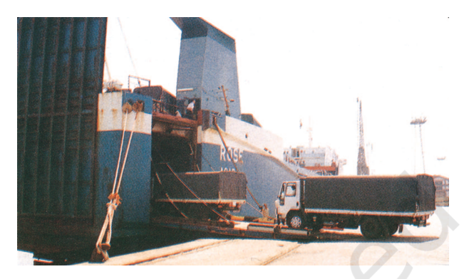
Fig. 7.6: Trucks being driven into the vessel at Mumbai port

Deendayal Port, is a tidal port. It caters to the convenient handling of exports and imports of highly productive granary and industrial belt stretching across UT of Jammu and Kashmir, and the states of Himachal Pradesh, Punjab, Haryana, Rajasthan and Gujarat.